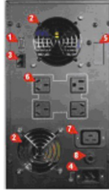
Army3000 Rear Panel